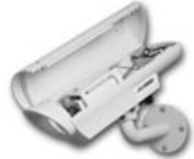
Housing in open position