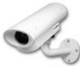
Housing with Sunshield

* This housing must be powered by a Class II source. This housing is to be used with a camera that meets Class II requirements.